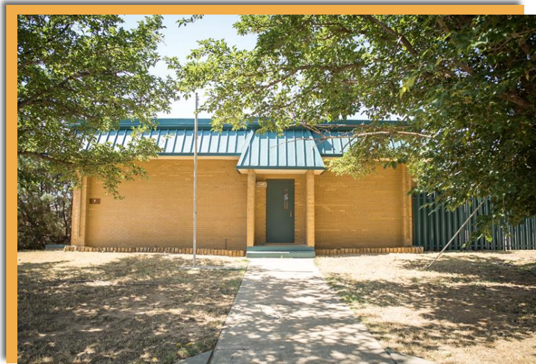
BUILDING #7 APPROXIMATELY 3,032 SF