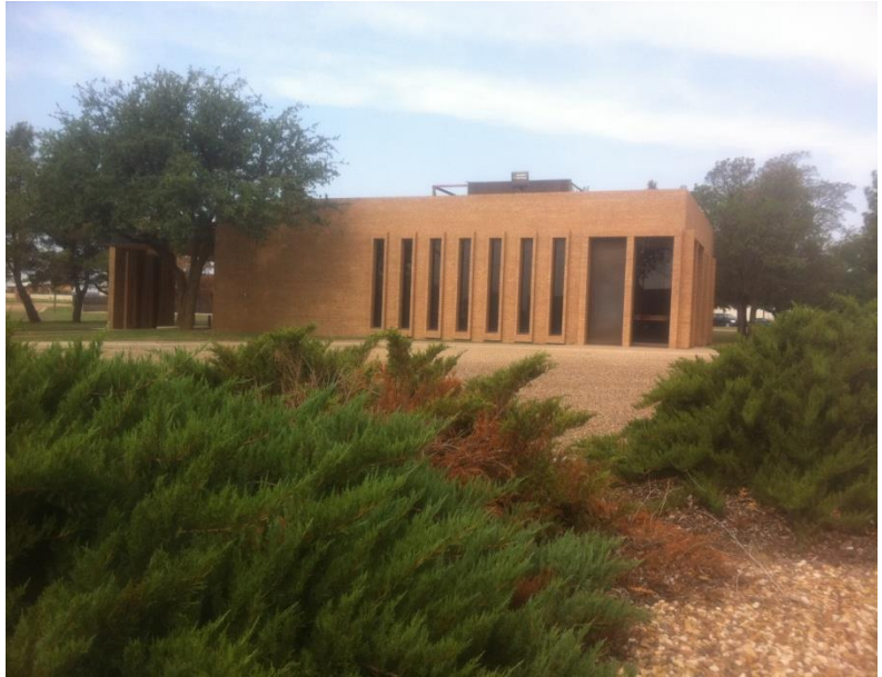
BUILDING 440 APPROXIMATELY 1,998 SF