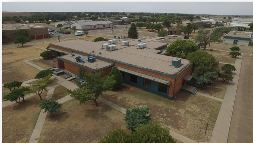
BUILDING #430 APPROXIMATELY 14,555 SF